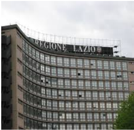
The Lazio Region's palace

Furthermore, Living Labs are often designed not only as a tool for promoting innovation and testing new products and services in real life contexts, but also for promoting local development according to a participatory approach.